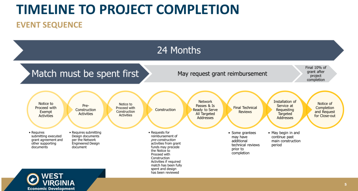
Figure 1: Project Timeline

ZoomGrants, an online grant application is utilized to analyze, award, applications of the WVBIP. ZoomGrants is also used to manage post-award grant activities. Post-award activities include distinct steps to ensure compliance with state, local, and federal laws, financial and technical feasibility, resilience, and to ensure the project awarded is completed in the way it was intended. Below outlines the event sequence of projects awarded under the WVBIP.